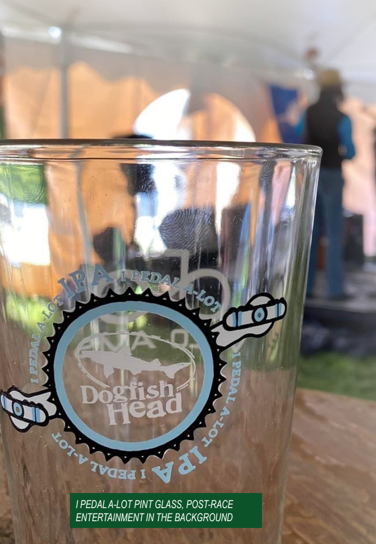
I PEDAL A-LOT PINT GLASS, POST-RACE ENTERTAINMENT IN THE BACKGROUND

On race day, 650 bike riders started their two wheeled tour at the Dogfish Head Craft Brewery in Milton and had the choice between a 60 or 120 kilometer course featuring several rest stops at properties owned and managed by Sussex County Land Trust. The day ended with a true Dogfish Head celebration at the brewery featuring local vendors, great food and libations and a bluegrass band!