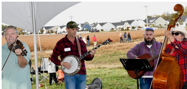
HOMESTEAD BLUEGRASS BAND, LIVE ENTERTAINMENT