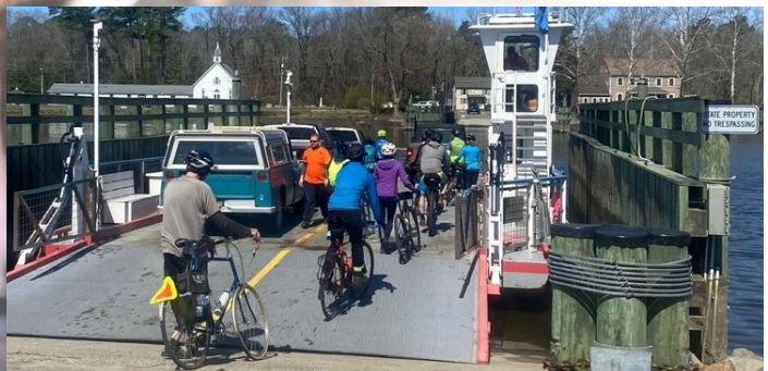
IPA RIDERS BOARDING THE WOODLAND FERRY AFTER A REST STOP AT NANTICOKE CROSSING PARK