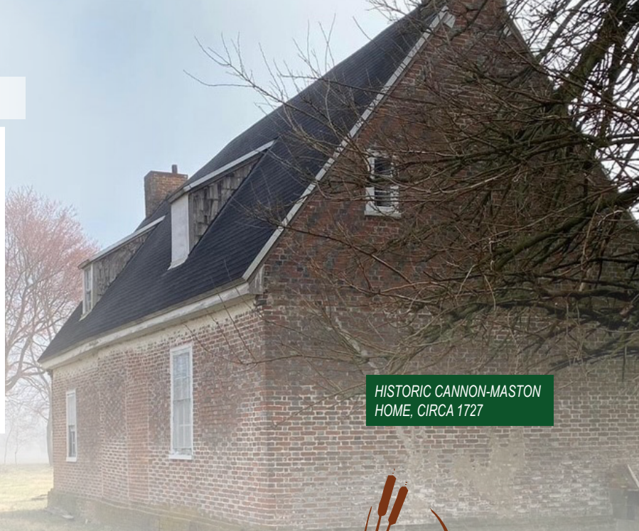
HISTORIC CANNON-MASTON HOME, CIRCA 1727