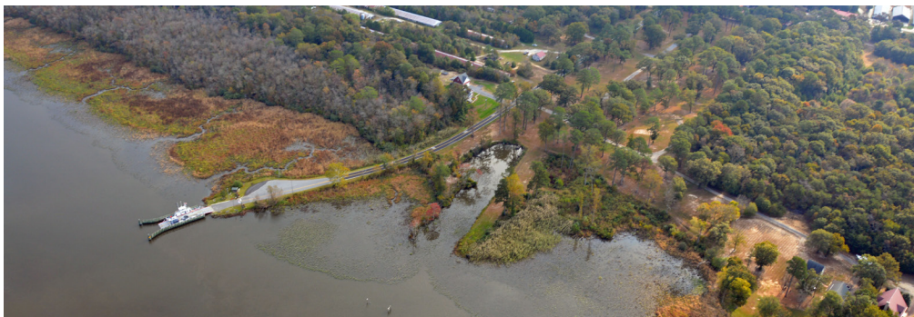
AERIAL IMAGE OF WOODLAND FERRY AND NANTICOKE CROSSING PARK

The public can use the park in a casual way to enjoy the river, watch the ferry, and walk the roads. Enjoy and know there is more to come.