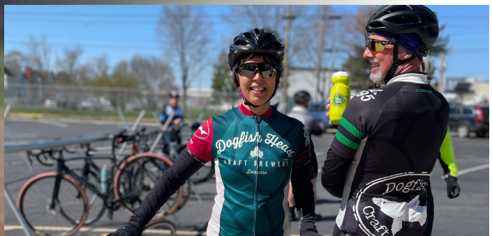
IPA RIDERS SHOWCASING THEIR DOGFISH RACE GEAR