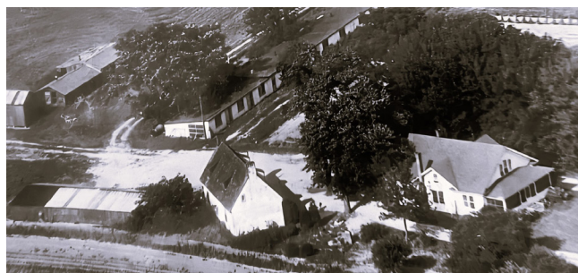
AERIAL IMAGE FROM 1950 OF WILLIAMS-LITCHFORD HOME WITH THE CANNON-MASTON HOME SITUATED DIRECTLY BEHIND IT. THE WILLIAMS-LITCHFORD HOME WAS RELOCATED TO THE WESTERN PORTION OF THE PROPERTY IN 2020

Work on the Williams-Litchford farmhouse continued with improvements to the building's basement level and removal of newer interior and exterior finishes to restore the structure's original appearance. Upcoming activities will include roof replacement, rehabilitation of original wood siding, and installation of new plumbing, HVAC, and electrical systems. Major elements of the project will be completed this year in preparation for occupancy and interpretation. The two historic farmsteads are located on 59 acres of field and forest purchased by the Trust in 2008. Efforts to develop a trail system for Ickford Park are also planned for what promises to be a busy 2023.